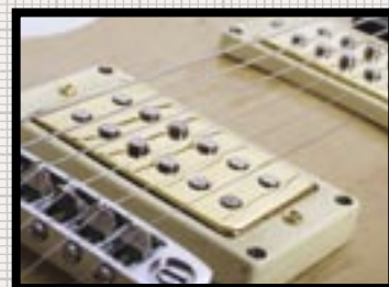
■ Twang's the thang for the Magna'Trons; more power than the TV Classics too