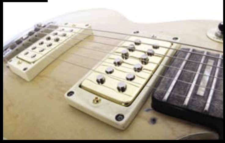
■ Big polepieces create a unique look for the Magna'Trons

higher impedance, and hence a higher output than the neck pickup. This is standard practice and compensates for the fact that the string is vibrating less nearer the bridge. The spacing of polepieces on the neck and bridge pickups is different too. This is an unusual feature – most pickup manufacturers use the same spacing for all positions – designed to suit the string spread of most traditional guitars. The neck units cover a spread of 48mm, while the bridge pickups span 52mm. On our test-bench guitars, this means that the poles of both sets of pickups lie directly under the strings, but you might want to check the string spacing on your guitar. A few millimetres either way is nothing to worry about.