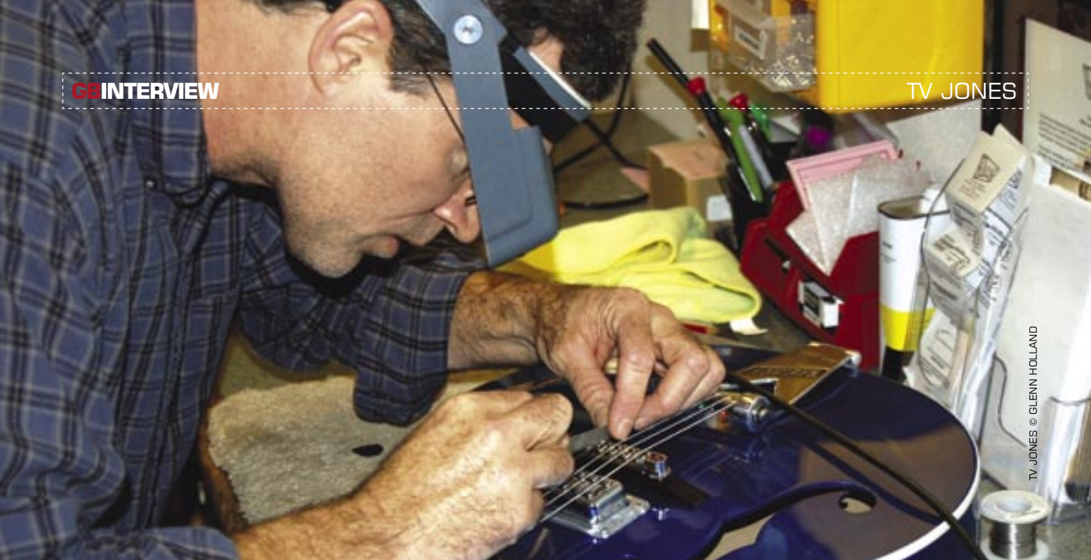
TV JONES