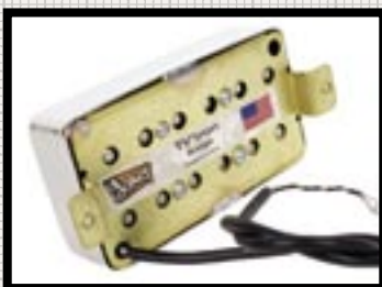
■ There is no fancy cloth hookup wire, or any coil-splitting options here

OPEN, TRANSPARENT, VINTAGE TONES: NOT YOUR AVERAGE HUMBUCKERS BY ANY MEANS