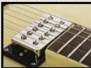
■ The TV Classics are all about vintage, low-power PAF-type tone